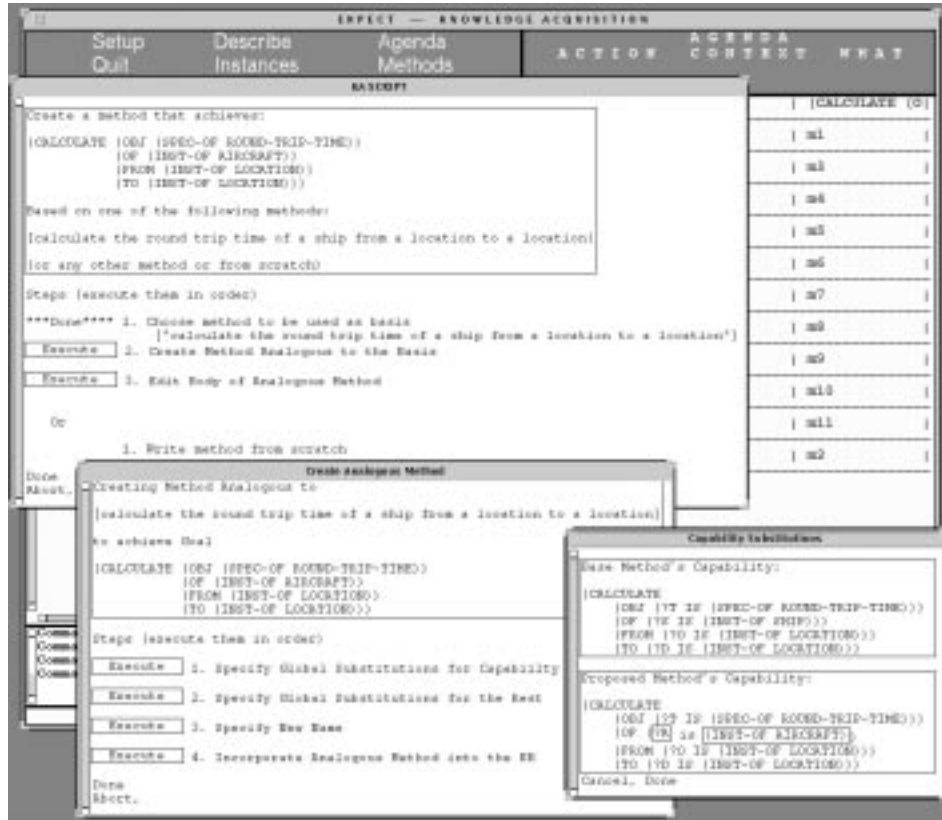
Figure 5: Snapshot of ETM's User Interface. The EXPECT's KA tool window is in the background overlapped by three other windows displayed by ETM during the execution of the KA Script of Figure 3. The back-most window shows the changes sequence of the KA Script. This snapshot was taken during the execution of change 2 (create a method analogous to the basis). On top of this window there is a window that guides the user step by step through the execution of this change. Finally, the front-most window is an ETM's suggestion for the first step (specify global substitutions for capability). Namely, substitute SHIP by AIRCRAFT and ?S by ?A.

contribute to the overall modification is also required. For example, after the first change of this scenario, EXPECT will report that the goal CALCULATE in M1 cannot be achieved and will suggest three possibilities: 1) modifying M1, 2) modifying some other method's capability, and 3) creating a new method. It cannot specify that it is method M2 the one that has to be modified in suggestion (2) because it does not know which method used to achieve goal CALCULATE before this change. It also cannot suggest the creation of a method for AIRCRAFT based on the method for SHIP because it is a fix that only applies to goals being made more general, and EXPECT does not know that that was the cause of the error.