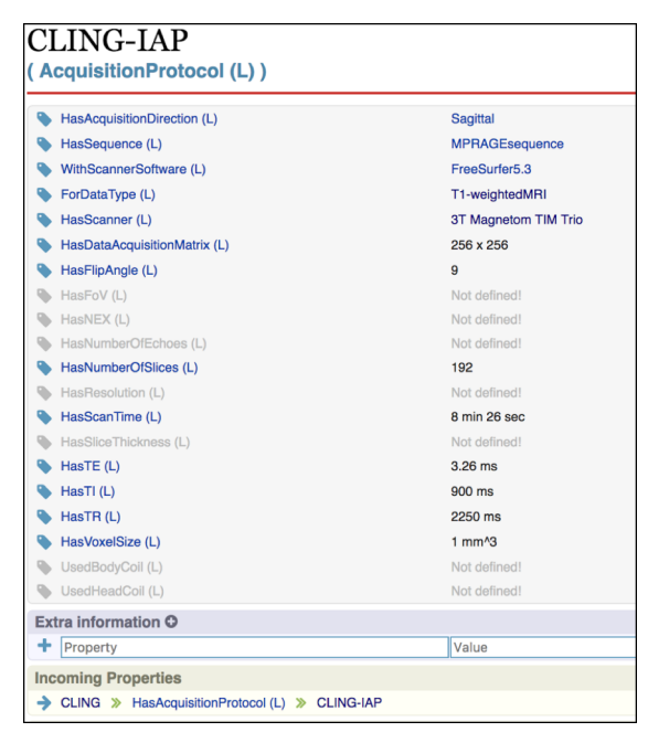
Figure 2: An example protocol page of the ENIGMA repository.

Many of these properties have an inverse. For example, the property "hasSeniorLead" has domain project and range "isSeniorLeperson, and adOfP" is its inverse. There are also additional properties that describe the ENIGMA concepts further. For example, a project has a "hasApprovedProposalForm" property that links to the proposal that the project leads originally submitted to describe the project and have it approved.